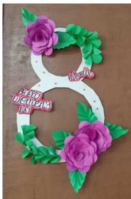
Simple yet significant decoration

Students of semester-VI organized a special celebration of Women's Day on 12.03.2025. All the faculty members including morning section joined the celebration to encourage the students. They welcomed the teachers with flowers and hand-made gifts. They decorated their seminar room very tastefully and organized a simple yet vibrant cultural programme. It contained recitation, vocal as well as dance recitals. Theme of the programme was to celebrate womanhood in all its glory. All the faculty members spoke on the occasion and emphasized the importance of understanding their rights as well as responsibilities. Principal madam graced the occasion and put emphasis on economic independence as the major enabler of a woman. The message of the entire celebration was to create an inclusive society where both men and women can thrive.