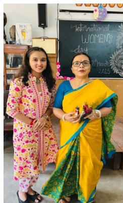
Welcoming the principal and the teachers with hand-made gifts