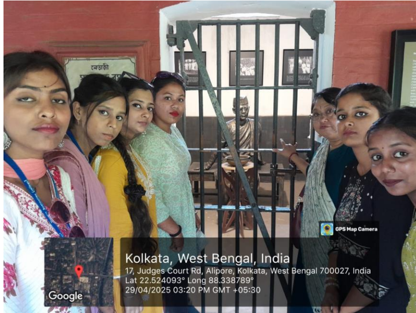
Cell of Netaji Subhaschandra Bose