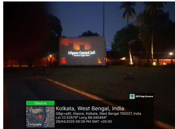
Light and Sound Show at Alipore Jail Museum