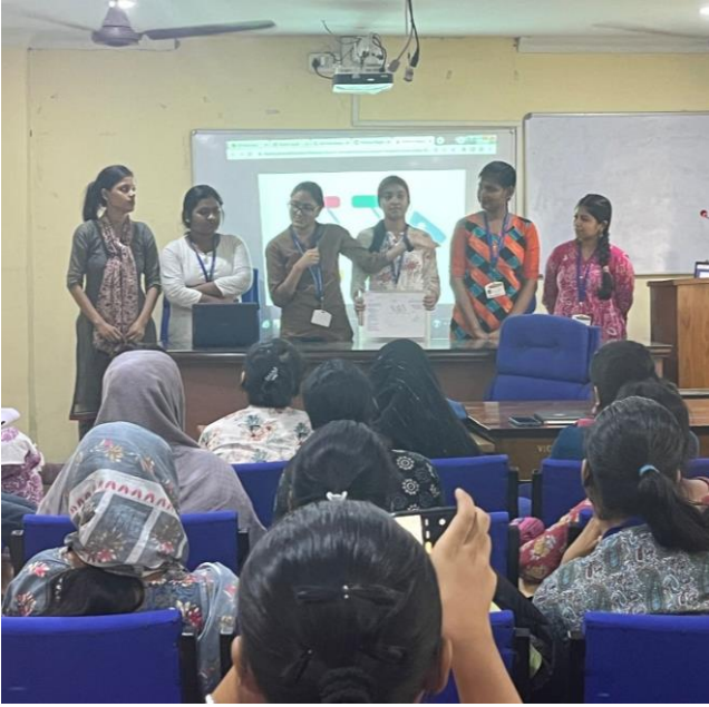
Presentation by Students