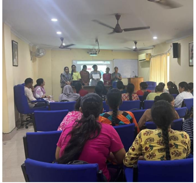
Presentation by Students