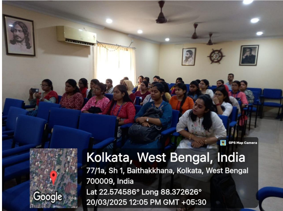
The audience of the lecture in the initial part of the workshop