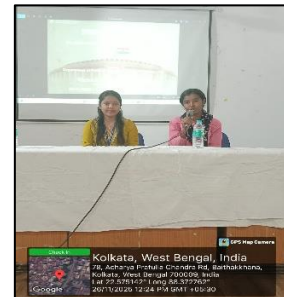
Presentation by students of Semester V