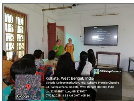
Principal addressing students on the occasion of International Women's Day

The film-show was followed by a robust interactive session where the students not only did film-reading but came up with their own experiences, as well as solutions. The programme was a huge success in the sense that the students were motivated to take their own independent steps.