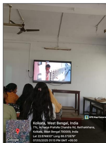
Scenes from Laapaata Ladies