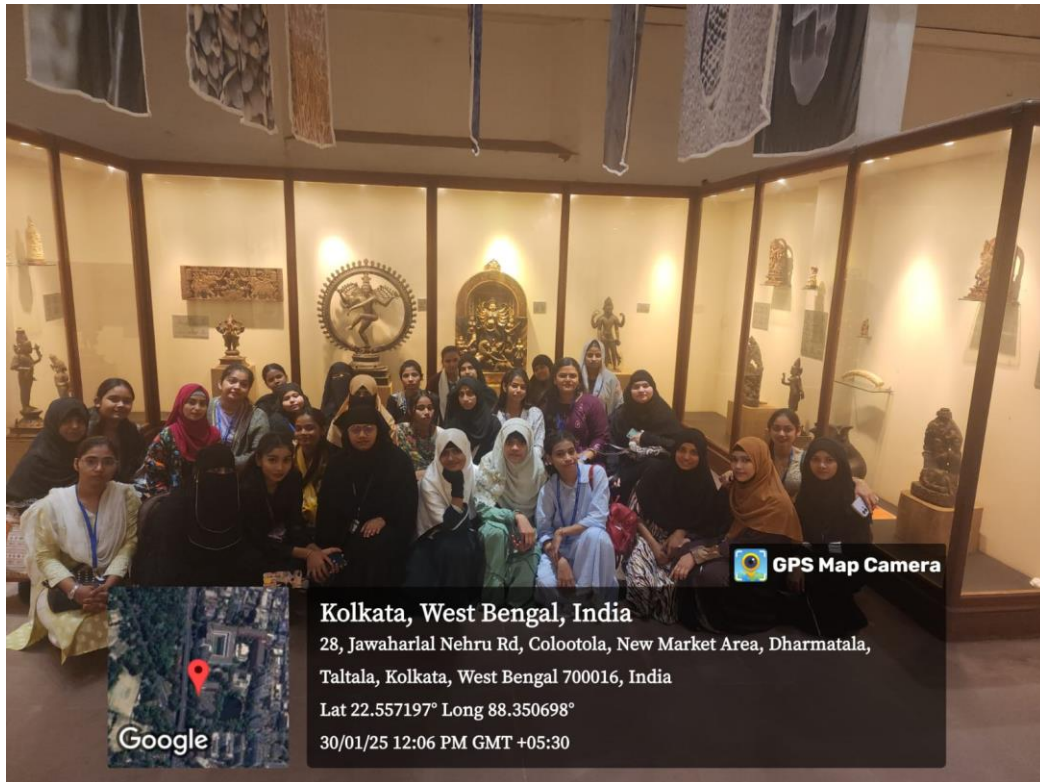
The students enjoying in Indian Museum