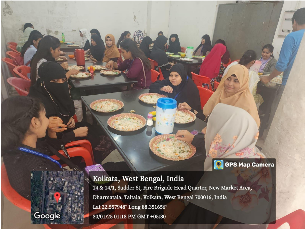
Students having lunch in the canteen of Indian Museum